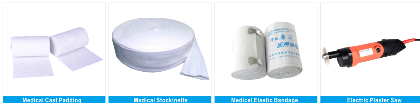
Medical Cast Padding